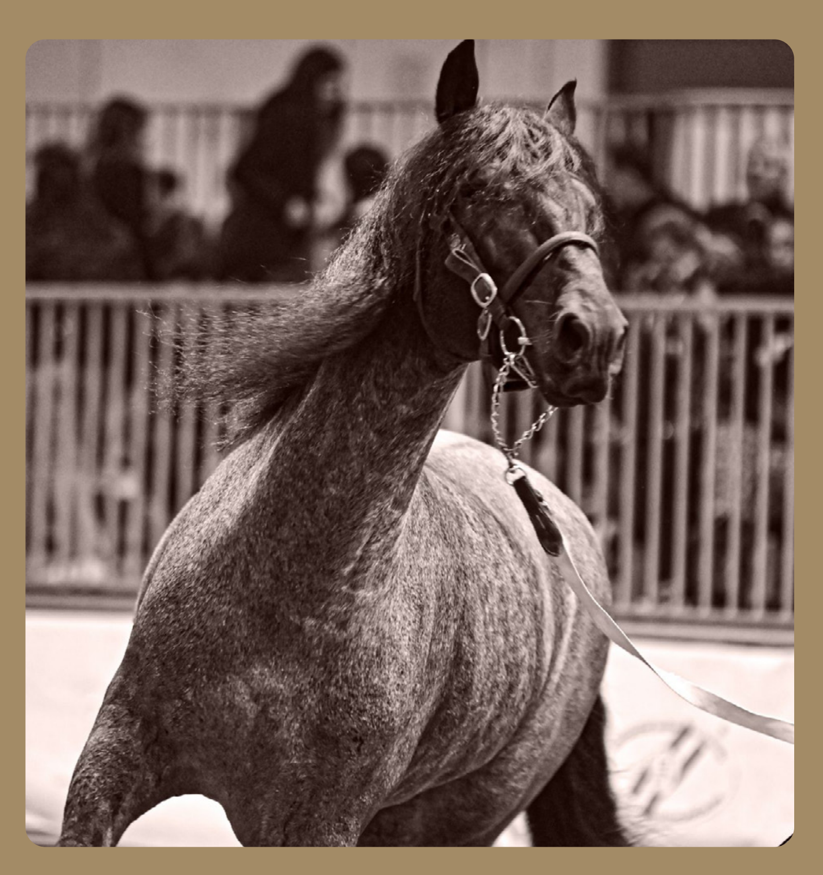
6-9 NOVEMBER 2025 VERONA