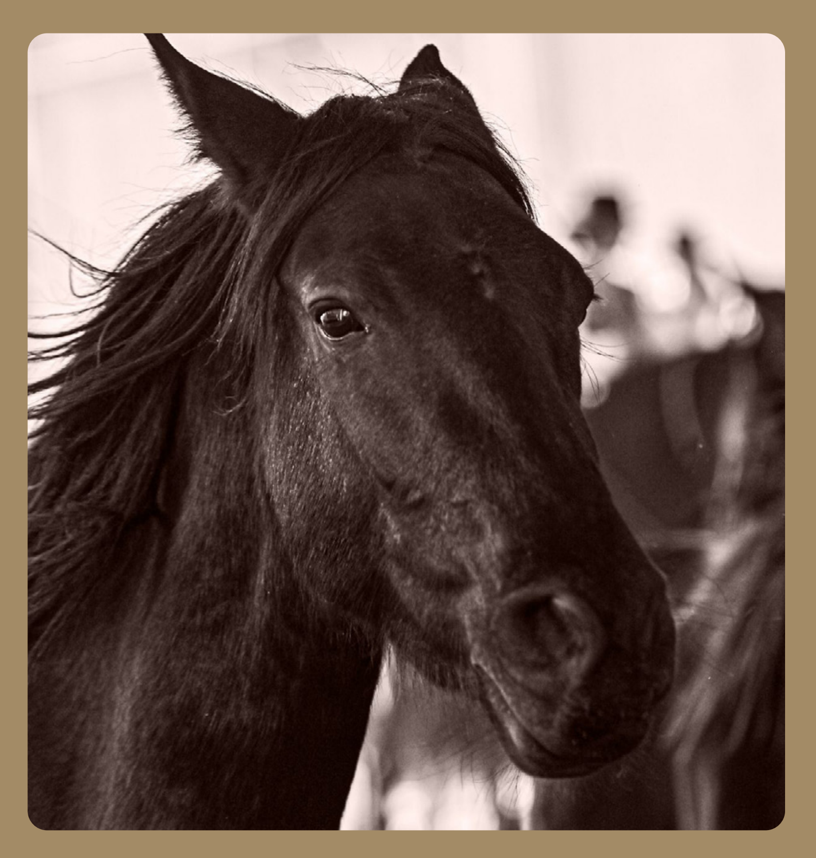
6-9 NOVEMBER 2025 VERONA