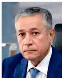
Samir Nuriyev, Chairman of the State Committee for Town Planning and Architecture of the Republic of Azerbaijan

BakuBuild Azerbaijan 2018 is an important trade event for the fields of architecture, construction, design and repair, which reflects the ongoing reforms in Azerbaijan’s construction sector and creates many new opportunities for local and foreign investors. As is tradition, international exhibitions and business meetings are an indication of growing interest in the country’s economy; they play an important role in expanding entrepreneurship as well. From this point of view, BakuBuild Azerbaijan 2018 is very helpful in establishing and expanding favourable business ties among business representatives. Implementation of all these large-scale construction works creates a great demand for modern construction products and equipment. From this point of view, the BakuBuild Azerbaijan 2018 is of special importance at a time when the construction sector in our country is developing thoroughly, rapidly and dynamically.