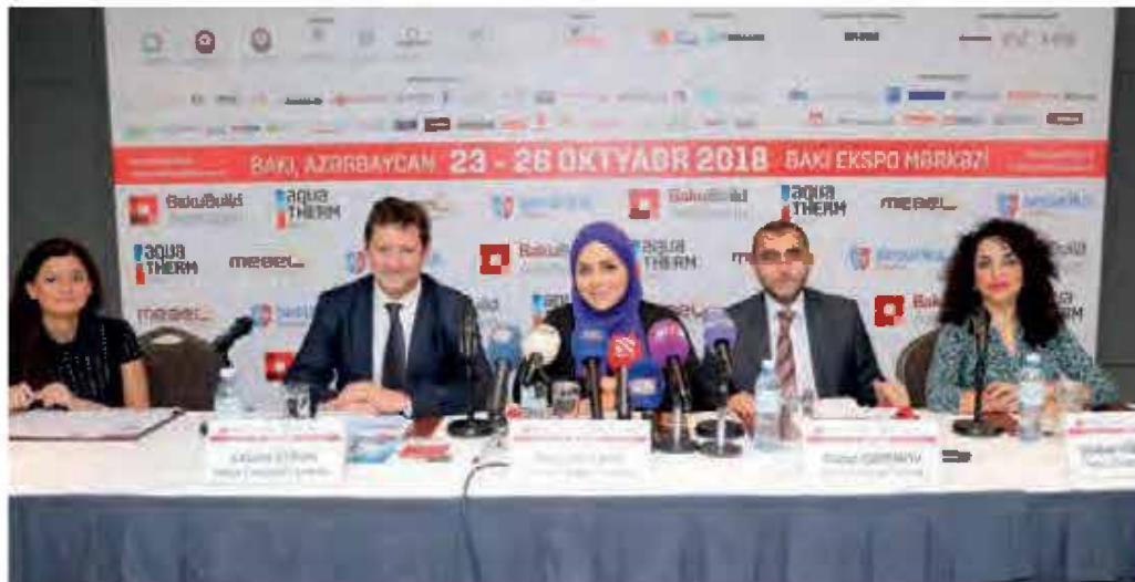
GENERAL INFORMATION PARTNER

8 TV channels showed the video about the exhibitions 22 times in daily news